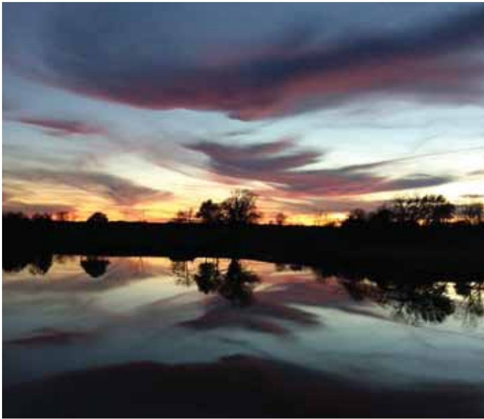
Submitted by Paul Grimes