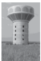
Northwest Sector Water Tower

The Oklahoma Department of Environmental Quality and City of Duncan Municipal Water crews routinely monitor for constituents in your drinking water according to federal and state laws. This table shows the results of our monitoring applicable to the period of January 1, 2015 through December 31, 2015. All drinking water, including bottled drinking water may be reasonably expected to contain at least small amounts of some constituents. It is important to remember that the presence of these constituents does not necessarily pose a health risk.