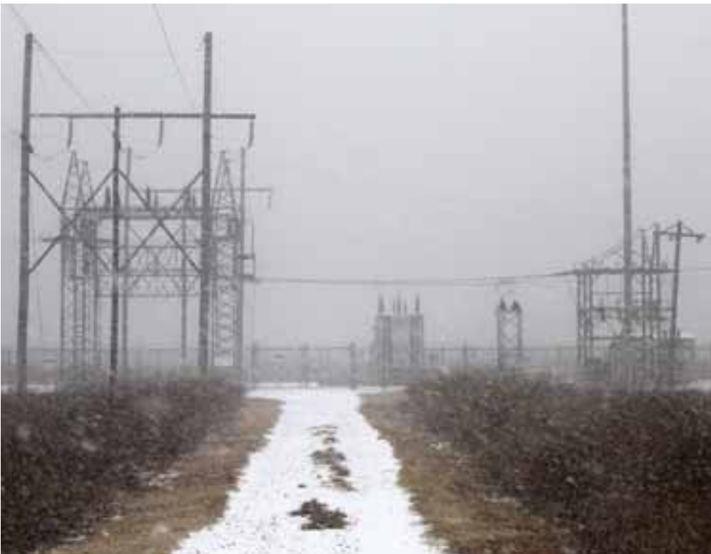
Swirling snow shrouds the Walters sub on Jan. 6. We are hoping this is as wintry as it will get in Cotton Electric's service territory.