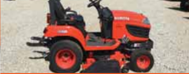
18HP • 54" Belly Mower