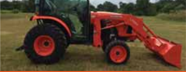
26HP • Cab • Kubota Loader/Bucket