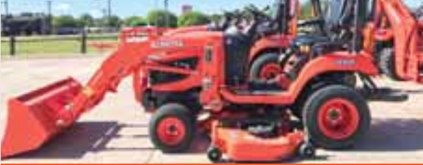
23HP • 60" Deck • Kubota Loader/Bucket