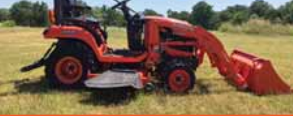
26HP • 60" Deck • Kubota Loader/Bucket