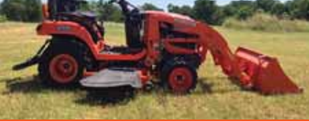
26HP • 60" Deck • Kubota Loader/Bucket