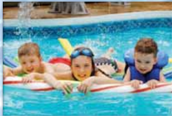
Above Ground Pool Packages