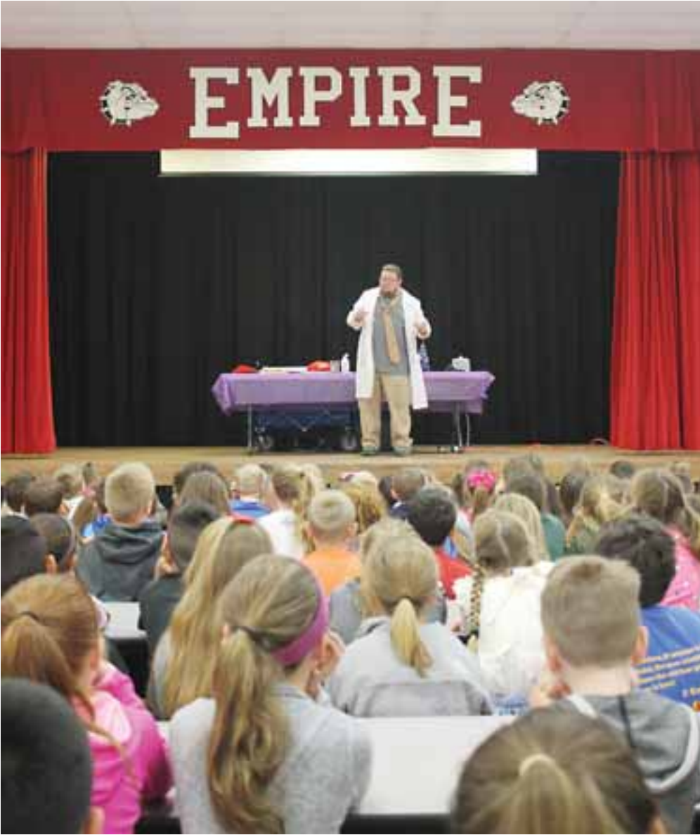
Empire Elementary students enjoy a presentation of Mad Science from the school's refurbished stage. The red stage curtains, embellished with the school name and Bulldog mascot, were purchased using a Cotton Electric Charitable Foundation grant. With the issuance of the grant in June 2017, the total donated by Cotton Electric members through CECF passed the $1 million mark.

Operation Round Up is a voluntary program and members may opt out at any time by calling or sending a letter or email stating the account holder's name, account number and the request to be removed.