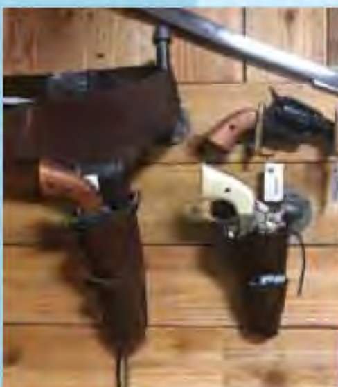
Replica Old West Guns