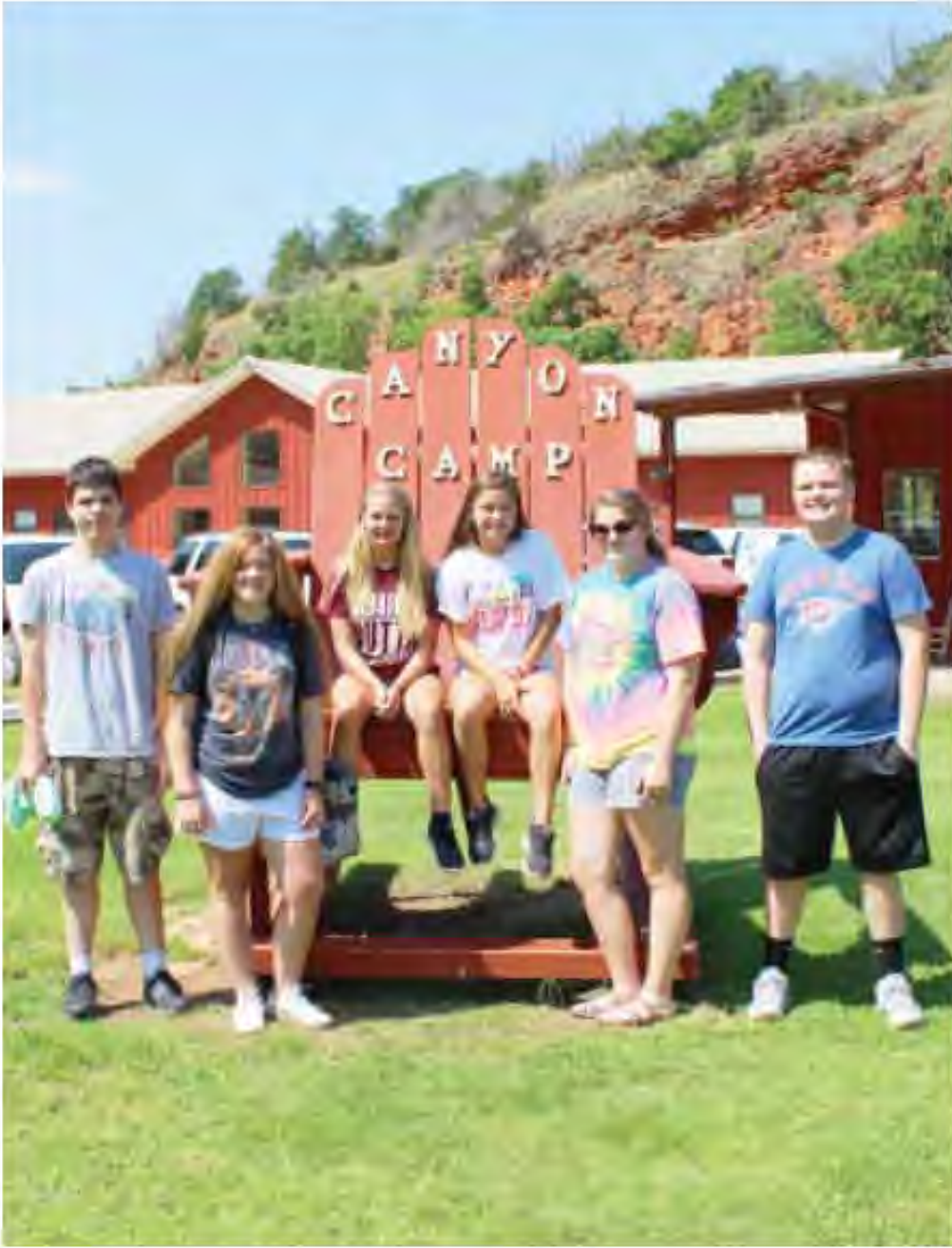
Cotton Electric Cooperative sent six local eighth-grade students to Youth Power Energy Camp during the last week in May. Energy Camp is designed to help students develop their leadership skills, have summertime fun and at the same time learn about one of rural America's most important industries - rural electrification. Find out more about Energy Camp in the July issue of The Current.