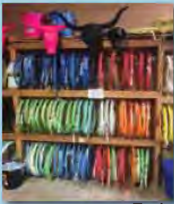
Tack & Gear