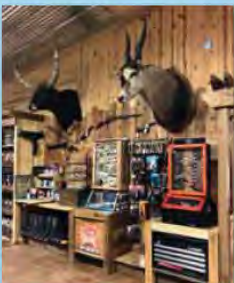
Case, Buck & Gerber Knives