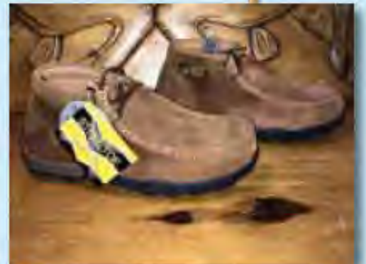
Steel Toes & FR Clothing

Stockman's makes Father's Day shopping a whole lot easier.