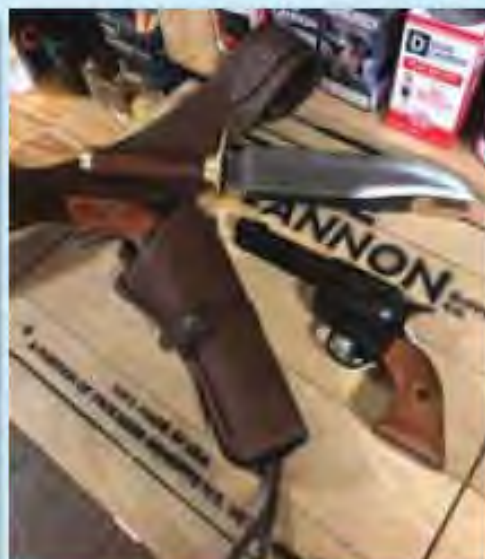
Duke Cannon Grooming Goods