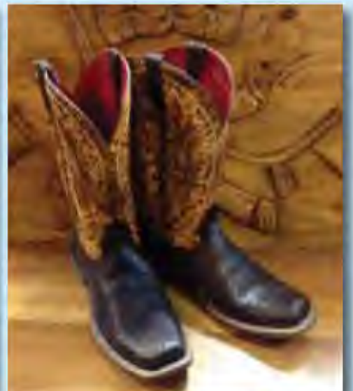
Western Boots & Clothing